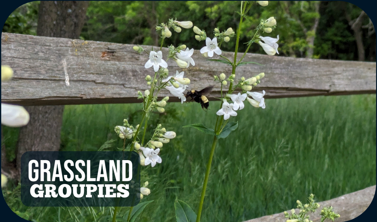
American Bumblebee in Pawnee Prairie Park pollinator garden.